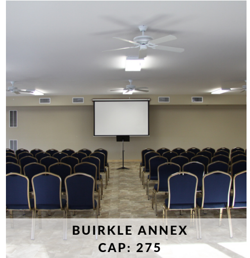
BUIRKLE ANNEX CAP: 275