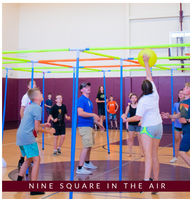
NINE SQUARE IN THE AIR