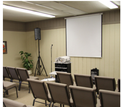
DEMAREST B CAP: 50