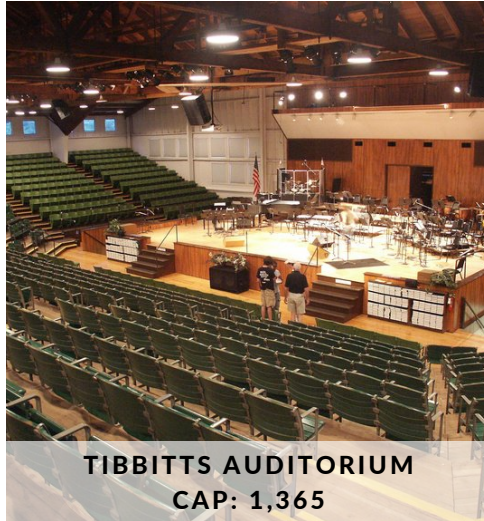
TIBBITTS AUDITORIUM CAP: 1,365