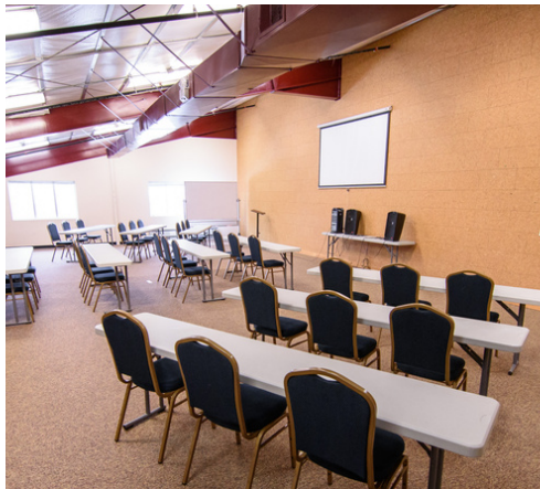
SONJU SPORTS COMPLEX CAP: 75