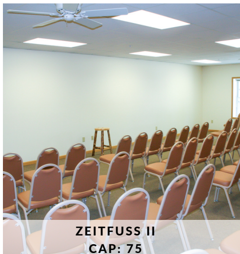
ZEITFUSS II CAP: 75