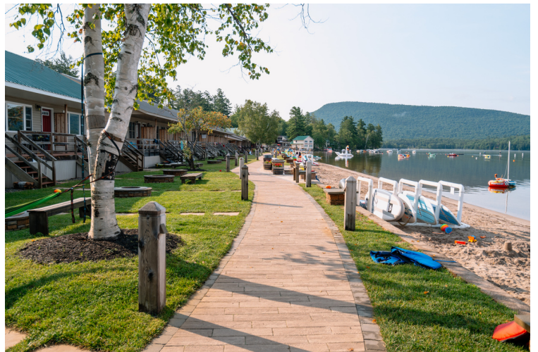
Beachfront and Lakeside