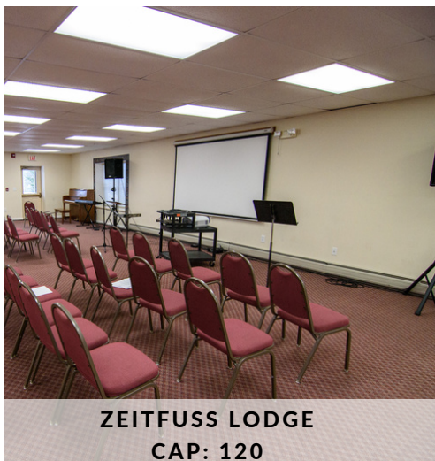
ZEITFUSS LODGE CAP: 120