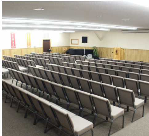
DEMAREST A CAP: 275