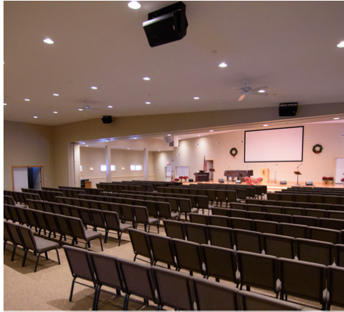
BUIRKLE CENTER CAP: 700

Groups of all sizes enjoy a wide range of meeting rooms that can hold groups of small and large sizes, perfect for main meetings, breakout rooms, seminars, or workshops.