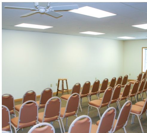
ZEITFUSS II CAP: 75