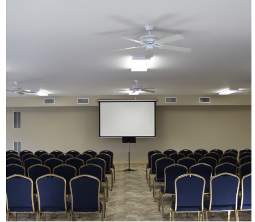
BUIRKLE ANNEX CAP: 275