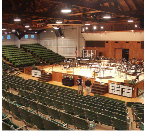
TIBBITTS AUDITORIUM CAP: 1,365