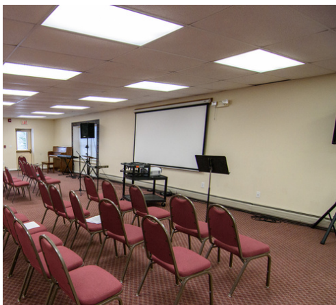
ZEITFUSS LODGE CAP: 120