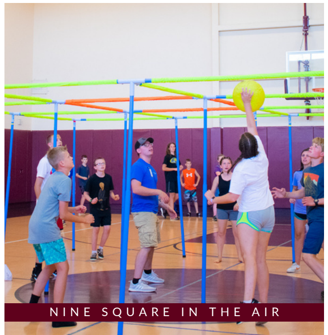
NINE SQUARE IN THE AIR